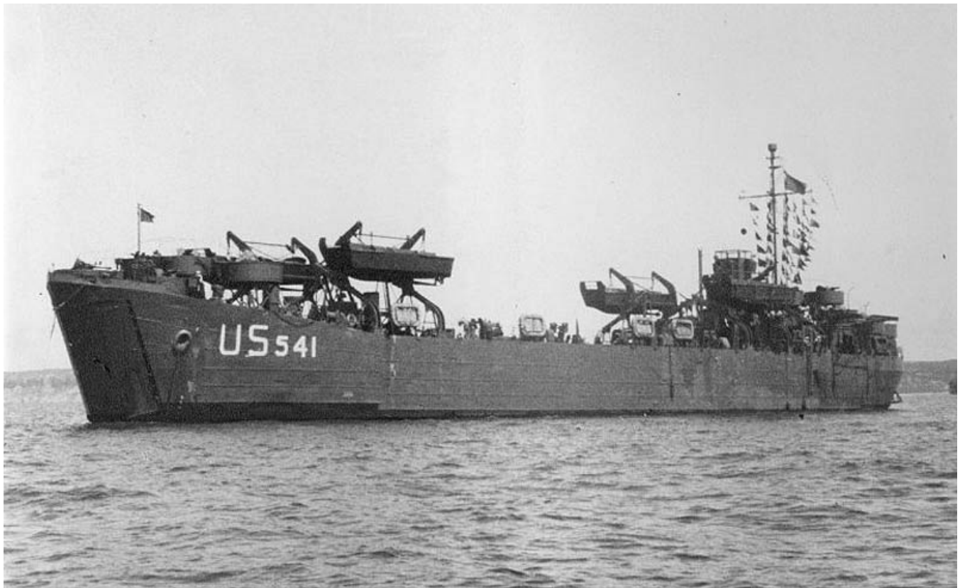
Although no photographs of LST-531 appear to have been preserved, LST-541 was one of the same type of LST and was constructed in the same shipyard in Evansville, Indiana

tion of the ship began there in September, 1943, and the vessel was launched two months and two days later in November. She was 328 feet long and 50 feet wide, with a displacement of 1,780 tons. Unloaded, the draft of the vessel was 2 feet 4 inches at the bow and 7 feet six inches at the stern; this increased to 8 feet 2 inches at the bow and 14 feet 1 inch in the stern when loaded with cargo. Equipped with two General Motors 12-567 diesel engines, running two shafts with twin rudders, she could do 12 knots. The LST-531 was designed for a crew of 10 officers and between 100-115 enlisted men.