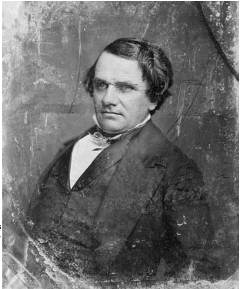
Stephen A Douglas (1813-1861) - Presidential candidate

for that. Like the youthful admiration for foreign institutions, I think violent surf assaults something which people recover their admiration of when they get older and more philosophical. If one wants to bathe, all right. Then let him go where he can master the water. If one wants to be battered – all right, too. Let him go where the water can master him... The partial pleasure of surf-bathing cannot be denied, but neither can it be denied that the sea re-resents invasion and knocks you around savagely... men like pleasure unmixed with pain, and it is a great deal nicer to plunge at will in still water, than to be an involuntary football for waves to vent their wrath on, and for profane outsiders to laugh at I've tried both kinds of bathing, and would rather have a quiet swim in a quiet stream, than have all the breath rocked out of me in the cradle of the deep. (Brooklyn Eagle, 1870a)